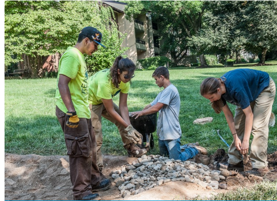
The READY Program hard at work

The READY program offers an ongoing maintenance program which visits the site 4-6 times per year to ensure the success of the storm water features installed.