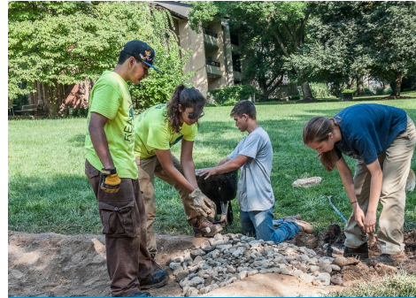
The READY Program hard at work

The READY program offers an ongoing maintenance program which visits the site 4-6 times per year to ensure the success of the stormwater features installed.